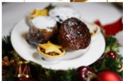
Traditional Christmas Pudding RM9.00