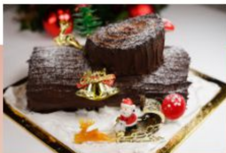
Buche De Noel Cerise et Mousse de Chocolat RM120