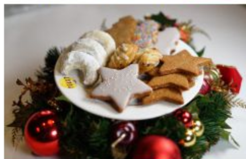
Zimtsterne (Cinnamon Star) RM2.20 Kris Kringle Cookies RM2.60