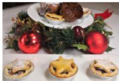
Traditional Mince Pie RM2.60