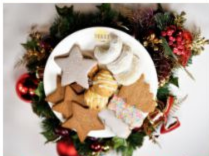
Vanille Kipferl Cookies RM1.20