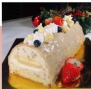
Buche De Noel Marron et Poire RM95